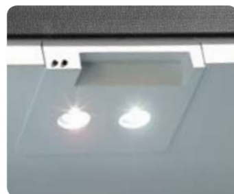
Perfect presentation with energy-saving technology: infrared sensor controlled LED interior light