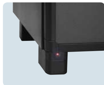
Optional extra: LED door opening control system with remote control